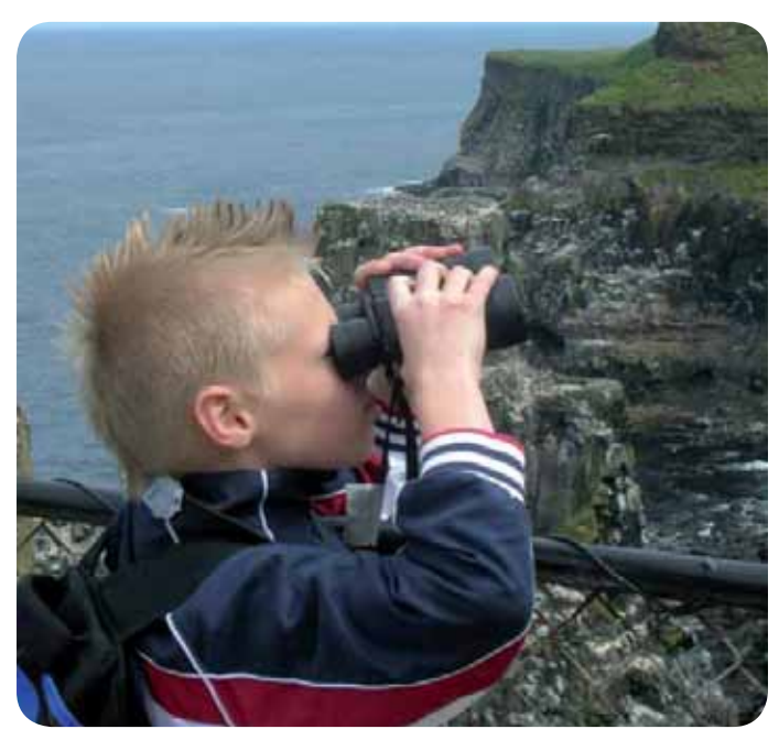
Fieldwork is a group experience. Pupils need to communicate with one another and with teachers

What is inclusion? The very nature of field work can promote inclusion but may result in exclusion. Take river studies for example where there are those individuals who come to the centre with the self-exclusion attitude expressed as "I'm not doing this." Or when they get to the river it's a case of "I'm not getting in there!" On the other hand there are always the pupils who lead the way. They are the first to get into the river and usually the last to get out. These hearty souls by way of example prompt the less willing to join in, even shouting words of encouragement. Therefore, without much input from others, there are some pupils who exclude themselves at the beginning and by the end of the fieldwork have taken part in some small way.